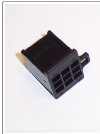
K&S # 01-0200