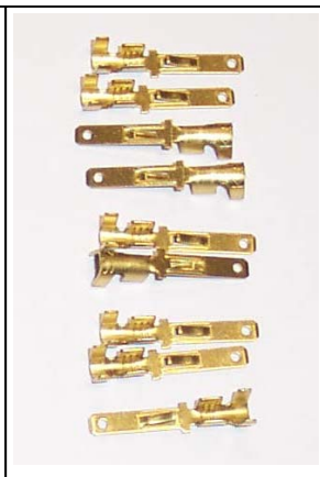
K&S # 01-0101