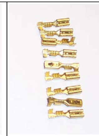
K&S # 01-0201